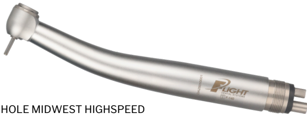
4 HOLE MIDWEST HIGHSPEED SKU: F-140 IC# - 20682 $301.00