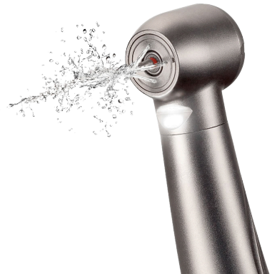
MINI HEAD NON OPTIC SKU: HB23K IC# - 18608 $839.99