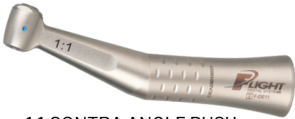
1:1 CONTRA ANGLE PUSH BUTTON LATCH BUR - SKU: F-DE11 IC# - 20631 $143.00

*(Model: F-DE01, F-DE11, F-DE74, F-DE41, F-DE41PS, F-140) and MK Models (HB23K, HB23KL, HE22KL, HE21KL)