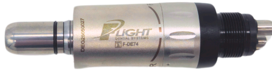
20K MINI AIR MOTOR SKU: F-DE74 IC# - 20634 $128.00